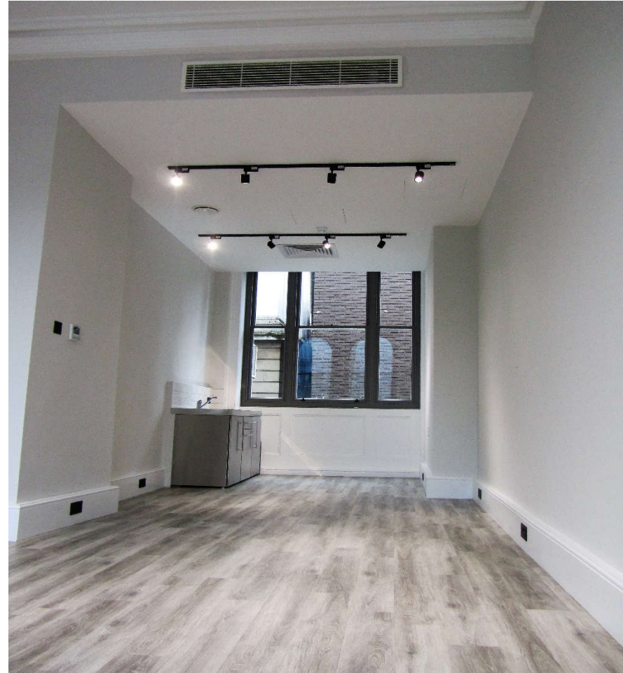
Image above shows first floor office area with new Amtico flooring, strip lighting and Tea point area.