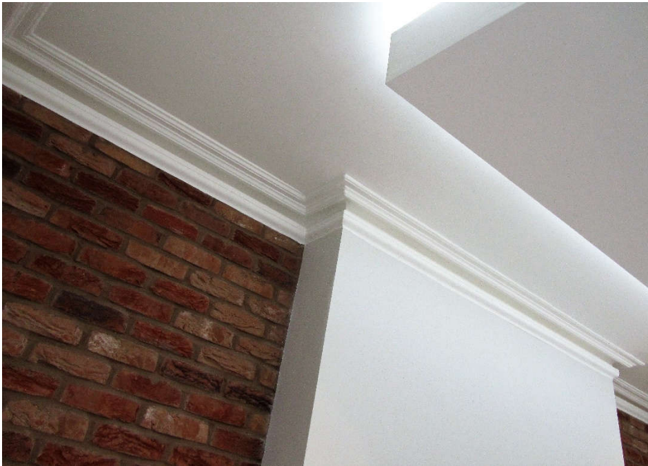
Image on left shows bricks slips to chimney breast Alcoves and restored plaster cornice.