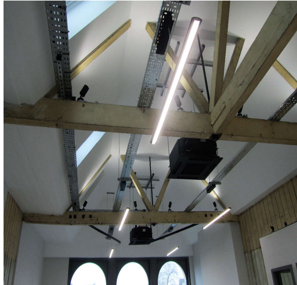
Image on right shows restored original Vaulted ceiling, new roof windows, lighting and air-conditioning units