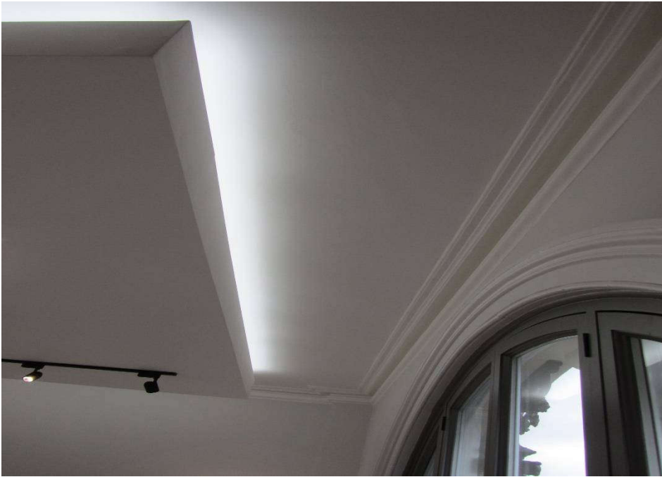
Image on left shows floating ceiling with LED lighting detail