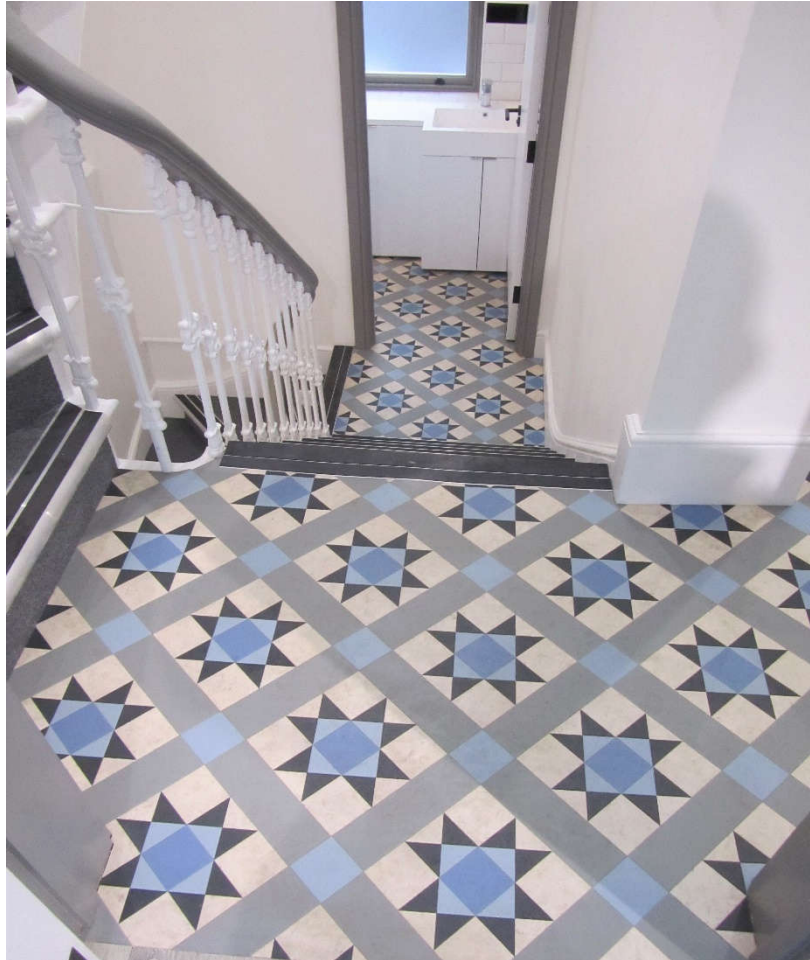
Image above shows Antico flooring to WC, staircase and landings.