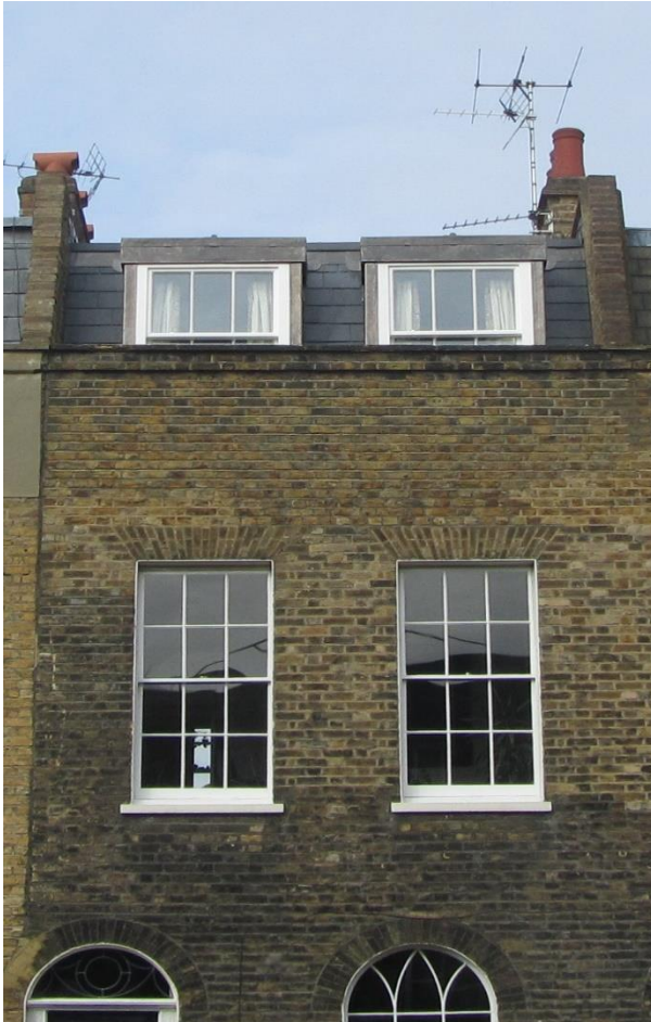
New lead clad dormer windows and hanging natural slates to mansard

This grade II listed Victorian terrace in Islington was in a prime location for further development so by adding a further bedroom with bathroom would not only increase the value but further enhance this property.