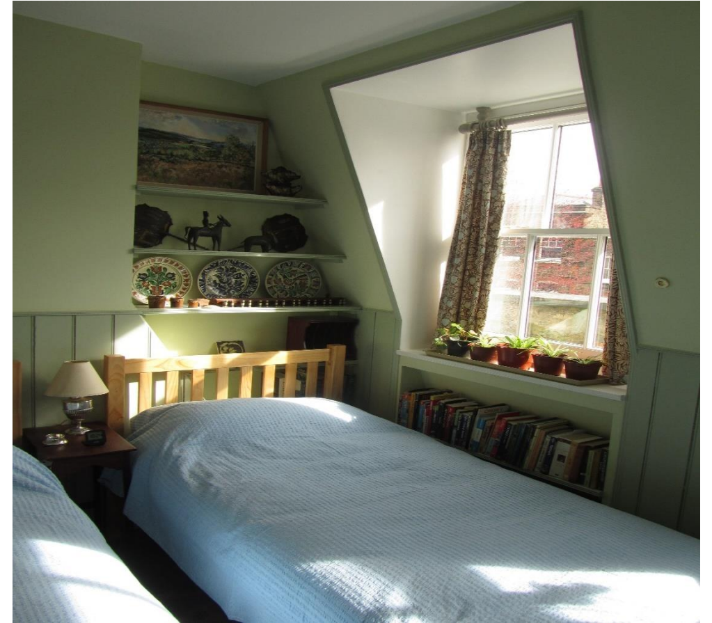
High spec sliding box sash windows, panelling and shelving

One of the main criteria set out by listed building consent was that the internal joinery matched the existing, this included skirting, architraves, wall panelling.