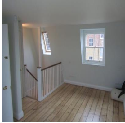
New mansard bedroom with polished reclaimed floor boards. Below rear Mansard with hanging natural slates and sash window.