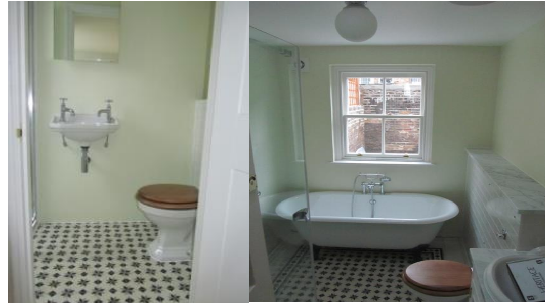
En-suite and master bathroom with traditional style sanitary ware and Victorian style floor tiles