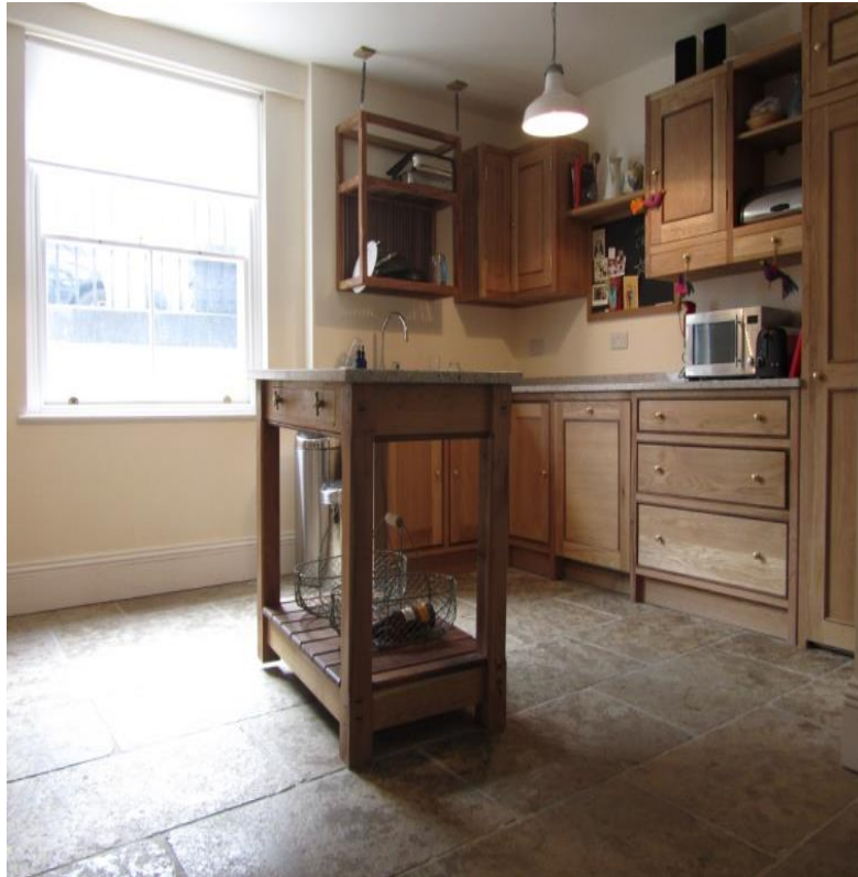
New hand built solid oak fitted kitchen with York stone floor with under floor heating beneath.